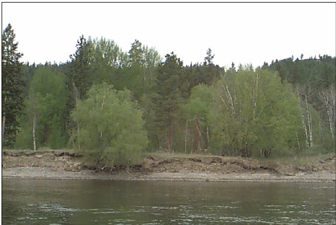
RIGHT BANK VIEW