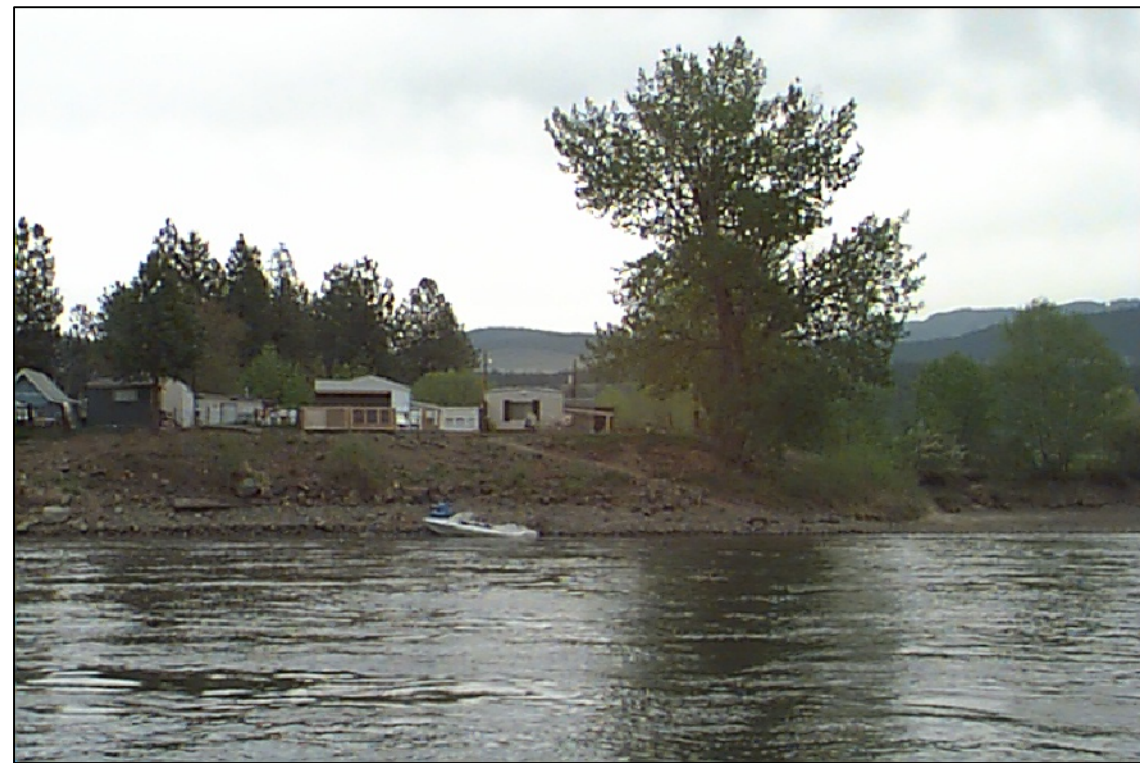
LEFT BANK VIEW